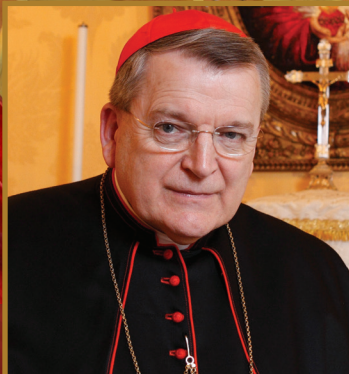
RAYMOND LEO CARDINAL BURKE