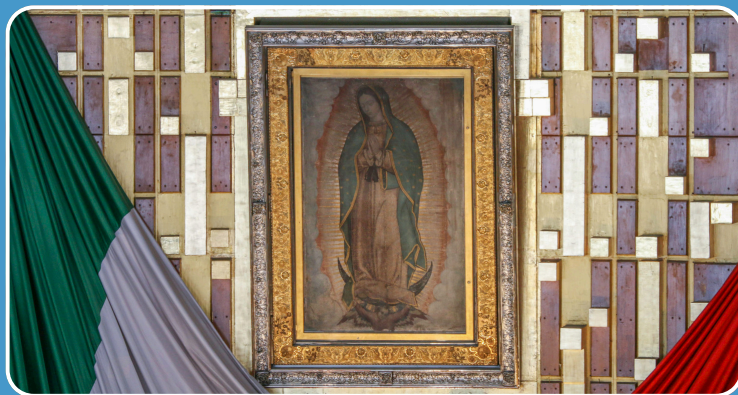
The Tilma of St. Juan Diego