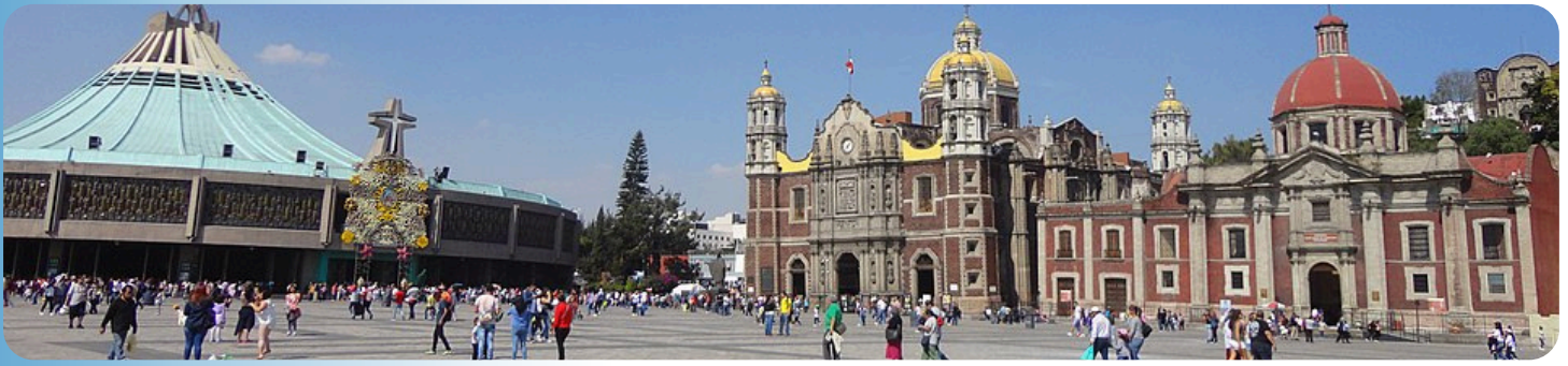
The Old and New Basilicas of Our Lady of Guadalupe, Mexico City