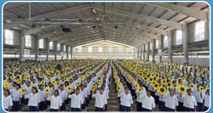
Sisters of Mary World Villages for Children, Girlstown