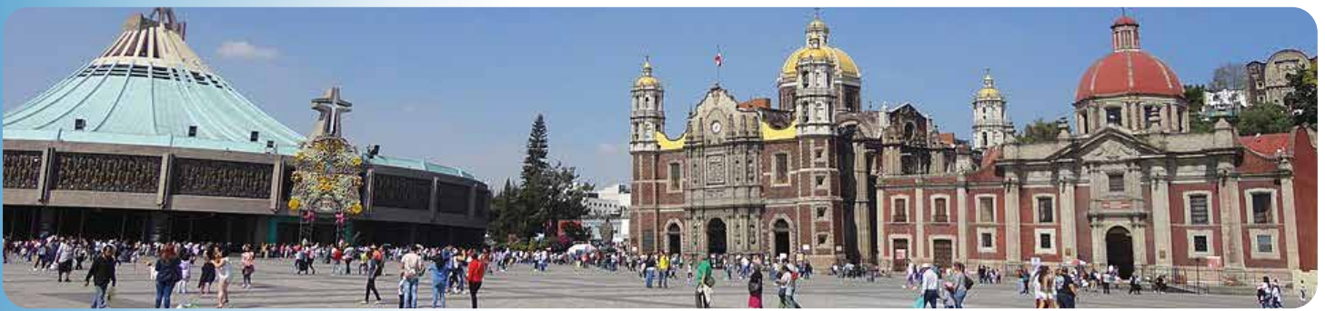
The Old and New Basilicas of Our Lady of Guadalupe, Mexico City