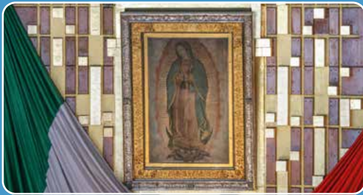
The Tilma of St. Juan Diego