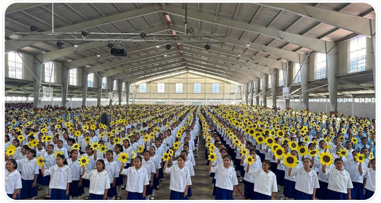
Sisters of Mary World Villages for Children, Girlstown