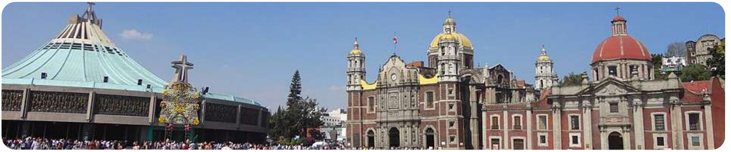
The Old and New Basilicas of Our Lady of Guadalupe and the Capuchinas Church, Mexico City