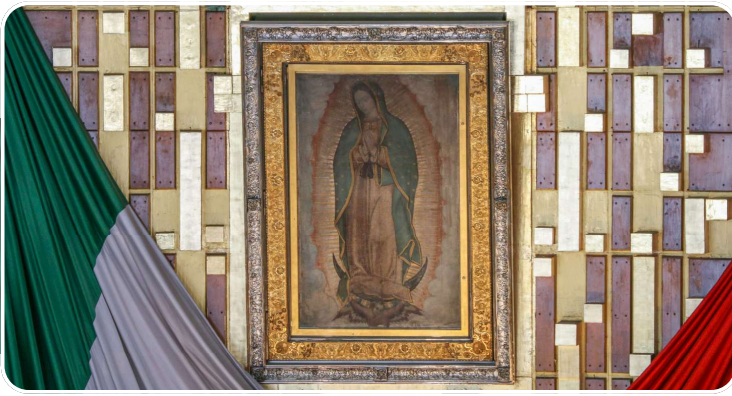
The Tilma of St. Juan Diego